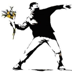
Society as change (above: Banksy)...

Department of Sociology and Social Work University of Wisconsin-Stevens Point